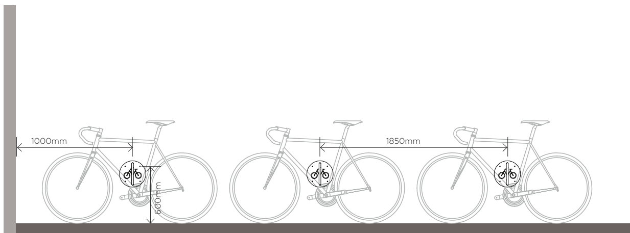
FRONT VIEW - MULTIPLE RACKS

Refer to Installation Instructions sheet for specific installation and assembly guidelines. Racks should NOT be installed based on this sheet alone.