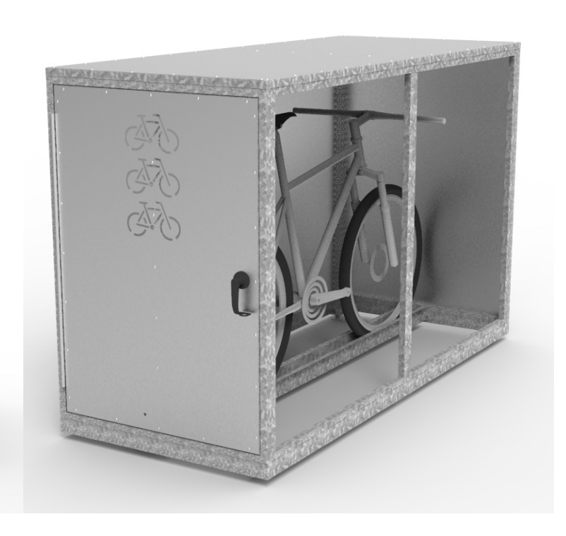
CBL1-LD (Light Duty Bike Locker)